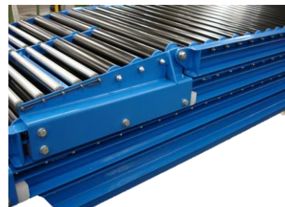
Heavy duty transfer