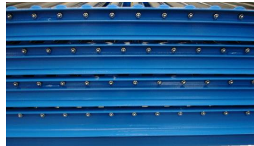
Heavy duty roller section