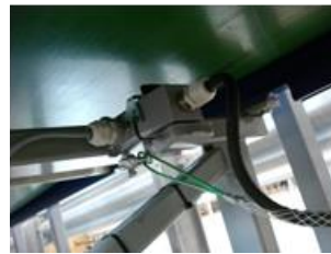
Cabling with strain relief