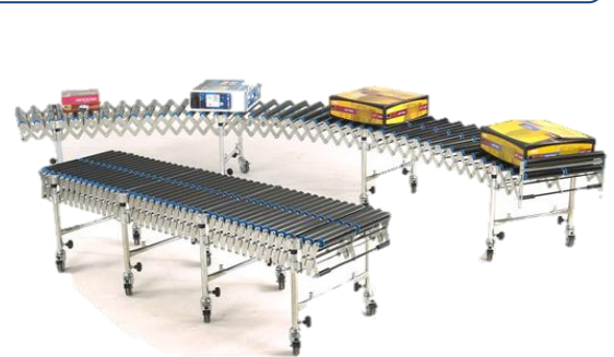
High-impact pvc rollers