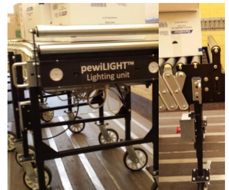
pewiLIGHT™, lighting unit.