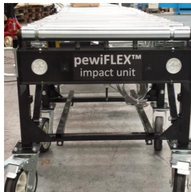
pewiFLEX™, impact unit