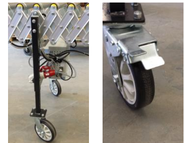
Sturdy wheels with and without brake